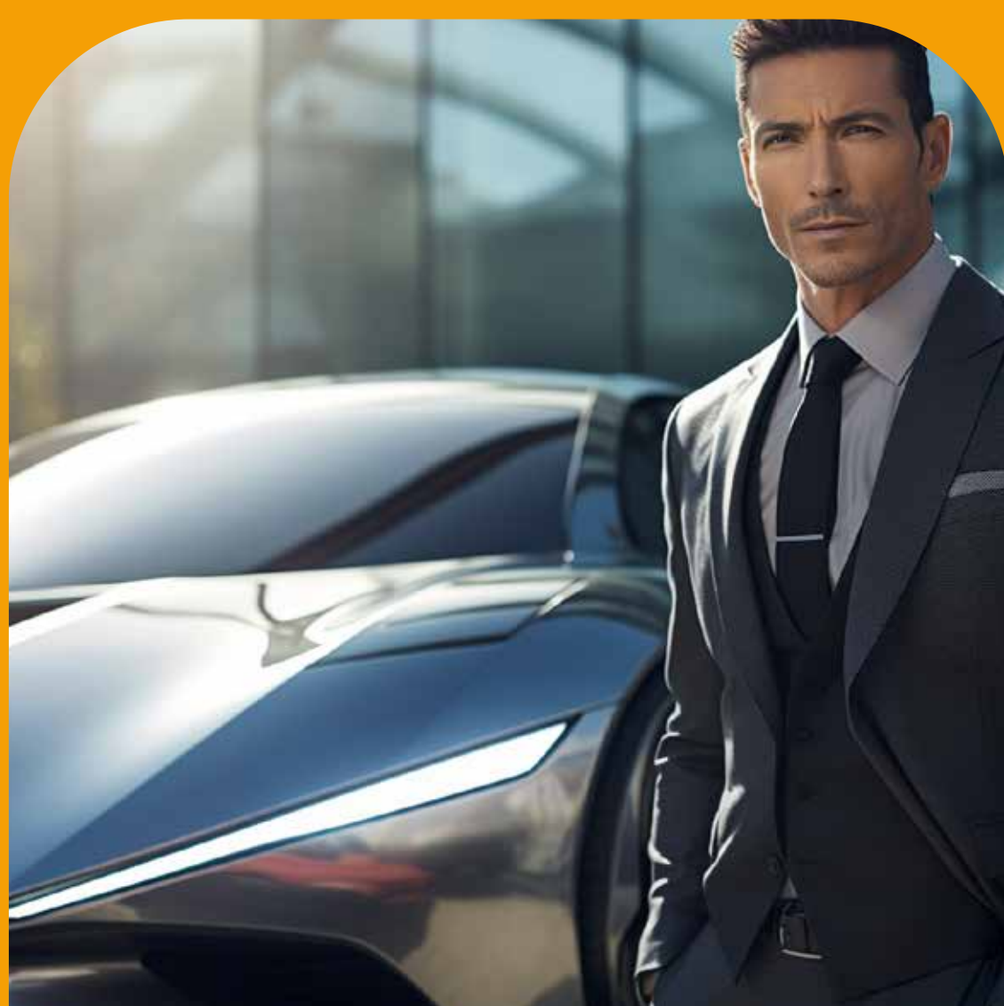
SOLAIRE PRO NANO CERAMIC PLUS

ADVANCED MULTILAYER OPTICAL NANOTECHNOLOGY FOR CLEAR, DURABLE AND ENERGY-EFFICIENT WINDOW FILM.