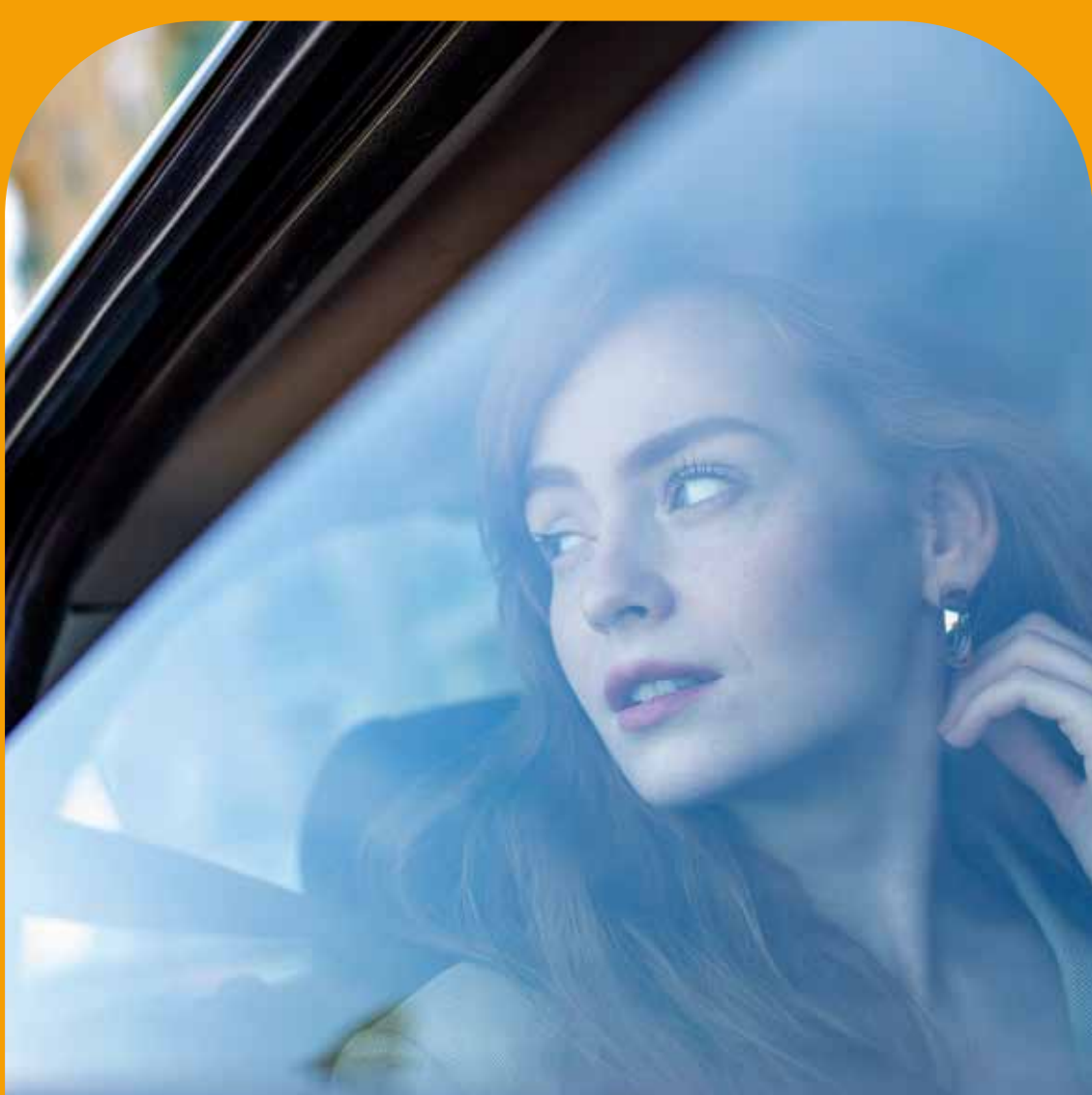
SOLAIRE PRO OPTICAL BLF