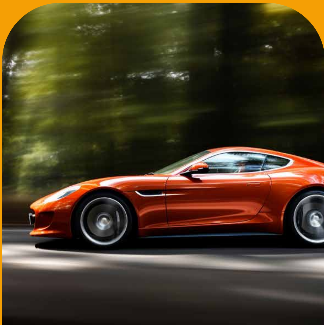
SOLAIRE PRO SPUTTERING